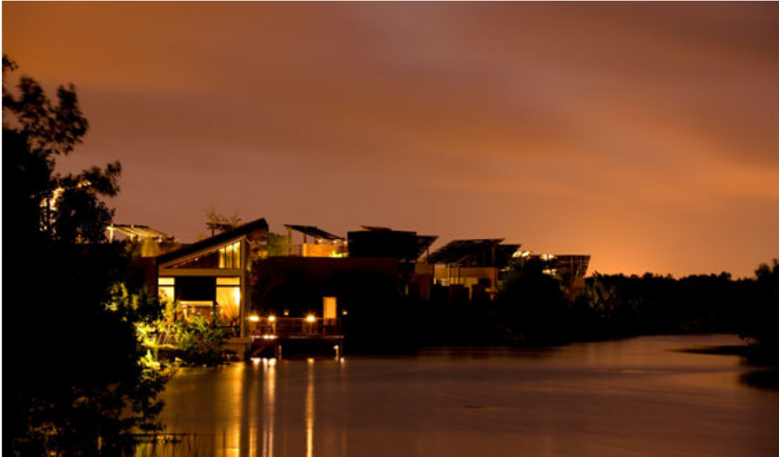
"Dinner at Mayakoba"

Friday, September 28th: Arrival Day: We will be waiting for you in the airport according to your flight schedule with a sign you're your name on it. You will be transferred to Mayakoba (:40 mins) and stay at one of the most iconic and luxurious Hotel; The Banyan Tree Mayakoba. There will be a Site Inspection and we are delighted to offer you a complimentary welcome dinner in conjunction with you host Hotel at one of their renowned restaurants. Overnight: Hotel Banyan Tree 1 nt. D ( http://www.banyantree.com )